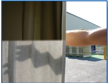
Totally Opaque Material Blocks the sun's UV rays providing cooler temperatures.