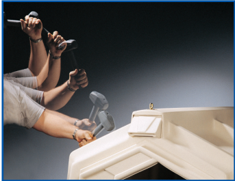
High Molecular Weight Polyethylene Extended life and durability - won't cold crack or break.

Calf-Tel housing systems are the most durable, economical and efficient available. Our systems will help you decrease labor, treatment and veterinarian costs.