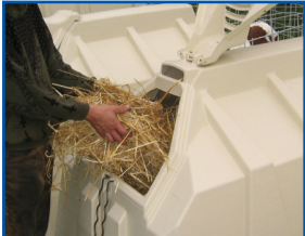
Full Open Bedding Door