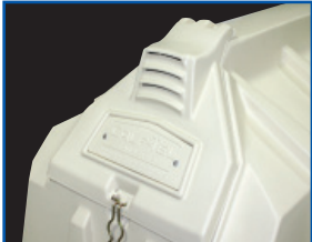
Fully Adjustable — Keep Calves Warm and Dry