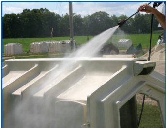
Bio-security Constructed of microbial-resistant materials - resulting in healthier calves.

At Hampel Corp., our products are built to last. We proudly stand behind our craftsmanship. Contact us for the complete details.