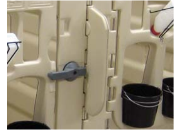
Rugged pen divider