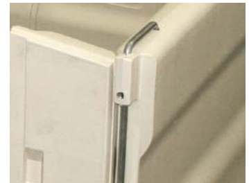
Solid steel hardware