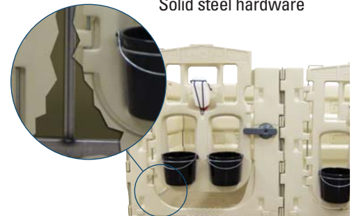
Fully encapsulated steel door frame – prevents sagging