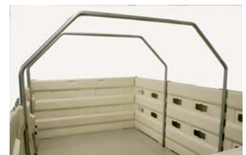
Convert to group housing