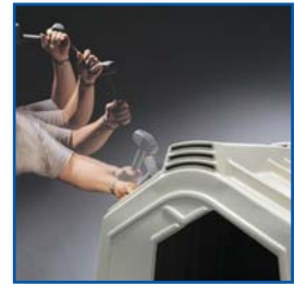
High Molecular Weight Polyethylene Extended life and durability - won't cold crack or break.