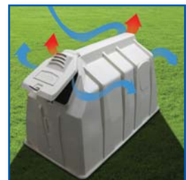
Unparalleled Ventilation Superior airflow, both for cold and hot environments.