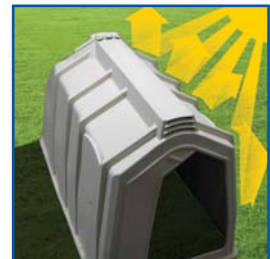
Totally Opaque Material Blocks the sun's UV rays providing cooler temperatures.