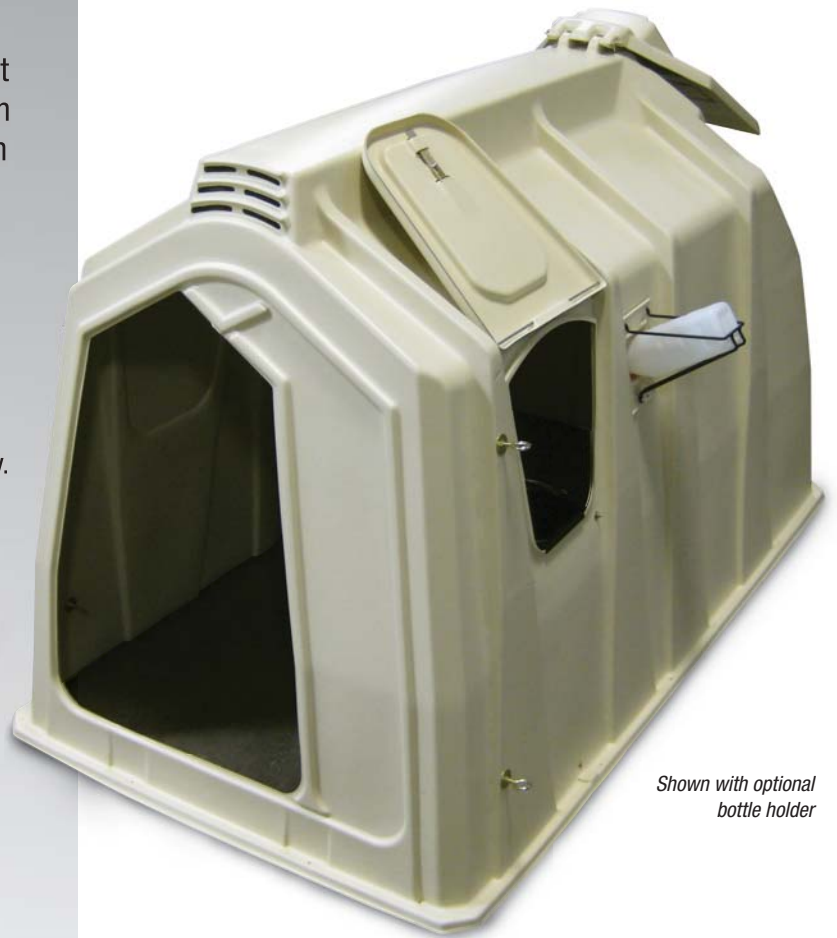
Shown with optional bottle holder