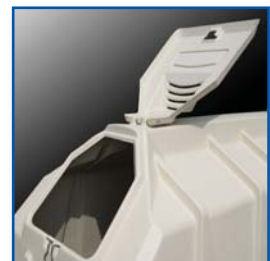
Easy Access Rear Bedding Door The best bedding access available.