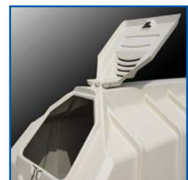
Easy Access Rear Bedding Door The best bedding access available.