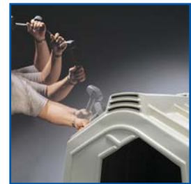
High Molecular Weight Polyethylene Extended life and durability - won't cold crack or break.

At Hampel Corp., our products are built to last. We proudly stand behind our craftsmanship. Contact us for the complete details.