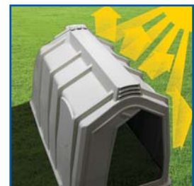
Totally Opaque Material Blocks the sun's UV rays providing cooler temperatures.